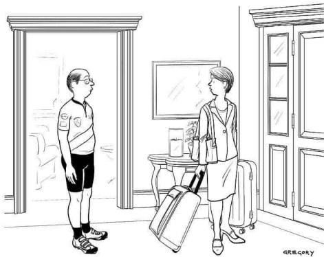
"Goodbye, Kevin. I could look the other way with the boozing and the skirt-chasing, but I did not sign up for bicycle clothes."