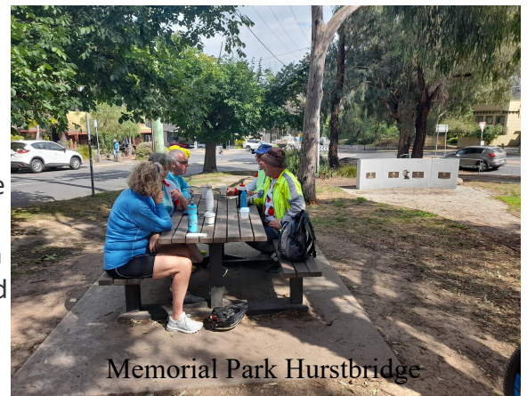
Memorial Park Hurstbridge

You can view a video of our ride from Diamond Creek to Hurstbridge here. Hurstbridge Club Ride Nillumbik Media Release