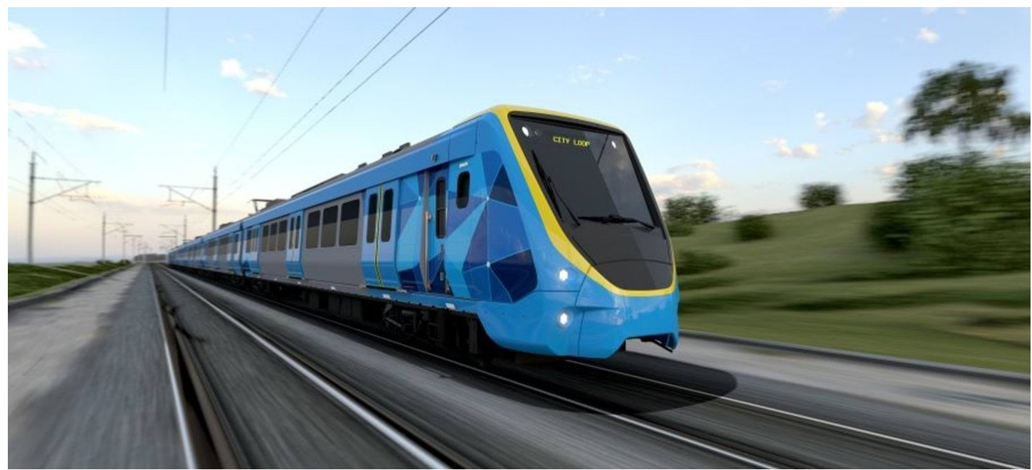
The Victorian Government is investing $986 million in 25 state-of-the-art X'Trapolis 2.0 trains and major upgrades to the Craigieburn Train Maintenance Facility in Melbourne's north. <u>Vic Gov Link</u>