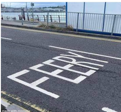
When TT-Line hire a local from East Devonport to paint the new road markings

Here is a video of the trail as I cycled down from Alexander Rd to Beasley's Nursery and Mullum Trail. The newest section of the trail is evident by the clean concrete. (Video)